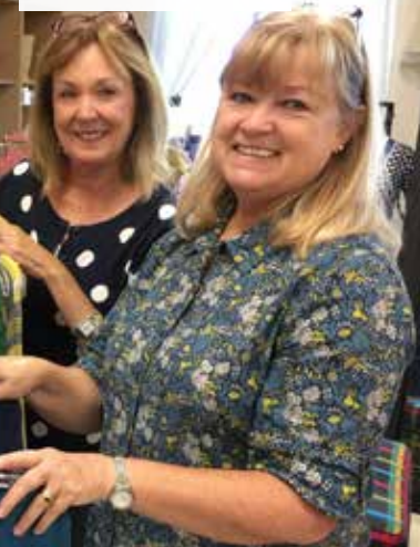
Gold Mine Volunteers