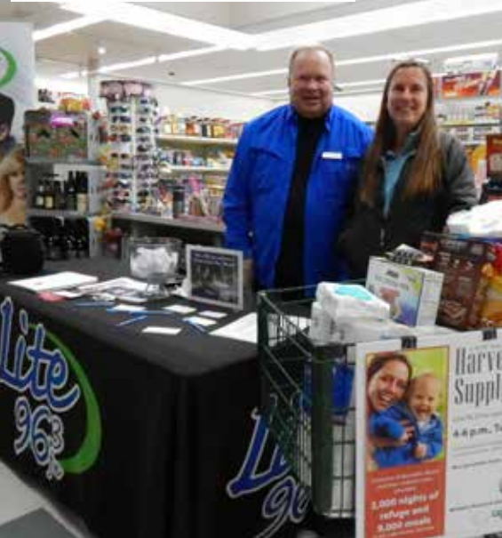
Lite 96.3 On-Air Donation Drive