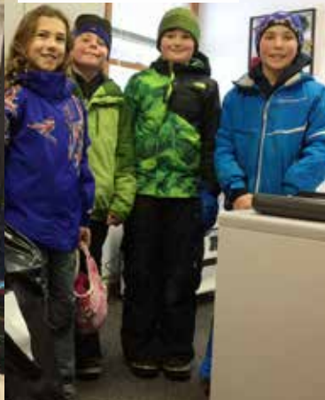
Montessori Christmas Families Donation