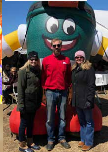
Meyer Ace Hardware Raffle