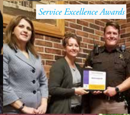
Service Excellence Awards