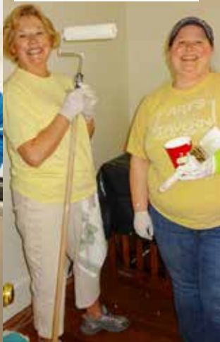
Zonta Club of Petoskey