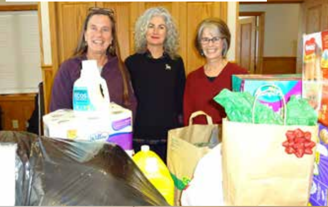
Forward Action Michigan Up North Chapter